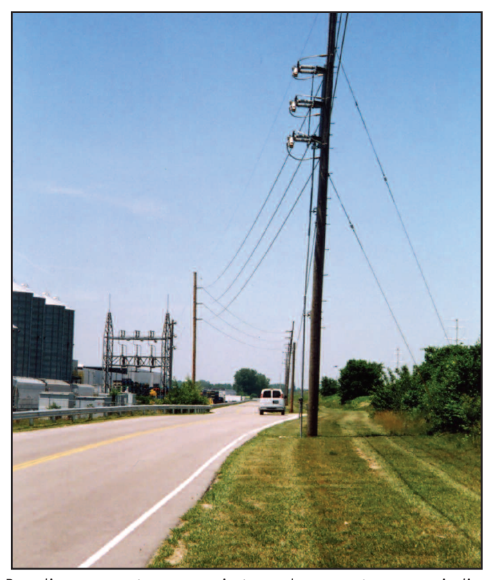
Powerline easement over a private road easement over a pipeline easement. Space is available for additional uses in the non-track area.

Mr. Rahn's clarification of the difference between the enhancement factor and the ATF (across the fence) value is partially correct. The argument that corridors have value greater than the land across the fence does reflect a belief in a synergistic effect created by a corridor. However, the base value, or ATF, of a corridor is itself based on the belief of a synergism in the assemblage of land pieces into a corridor. This synergism is expressed in the belief that once assembled, the corridor has a value at least equal to the land across the fence. Small, narrow pieces of land seldom have the same functional utility as typical lots in the area and therefore often reflect a lower market price. But when combined to create a corridor, they may have greater functional use, depending on market conditions. This is an assumption that is almost never disclosed to readers of appraisal reports of railroad corridors and when not disclosed, I believe, constitutes a violation of professional standards. Uniform Standards of Professional Appraisal Practice (USPAP) require that hypothetical conditions and major assumptions which impact the valuation of a property must be disclosed.