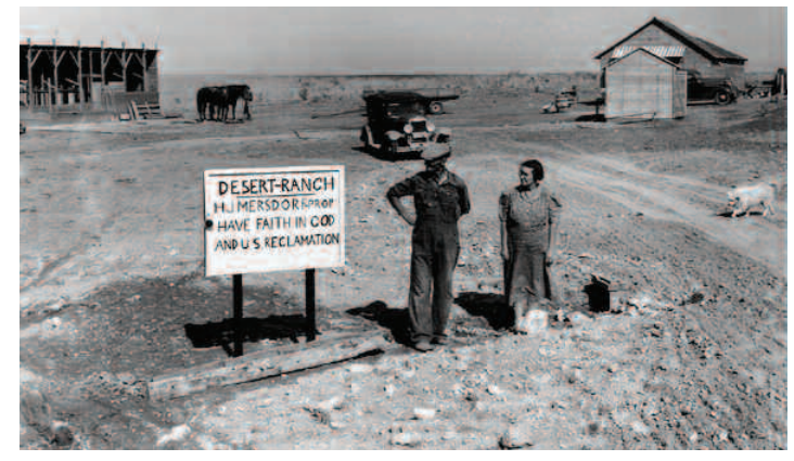
Reclamation played a major role in agricultural development in the arid western states. This small farmer is anticipating water deliveries from the Boise Project, near Caldwell, Idaho.

We also have a growing workload in acquisition and management of land and water for environmental mitigation, which is legally required to offset impacts of some of our project facilities or operations. These acquisitions generally involve threatened or endangered plant or animal species. We also support activities related to increased security at our facilities.