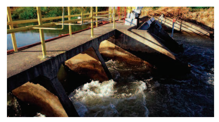
Typical canal diversion structure with remote gauging and metering system installed.

As I mentioned, Reclamation and IRWA are currently discussing a partnering agreement that could help us in the training and recruitment area. Hopefully, over time, agencies like Reclamation can evolve more of their processes and become more consistent with industry-wide methods. This would enable the pool of available professionals to be broader, and it would ensure the use of contract consultants would become easier. Both private industry and Federal agencies will benefit when professionals can more easily 'cross pollinate' and move among agency/industry lines with less difficulty.