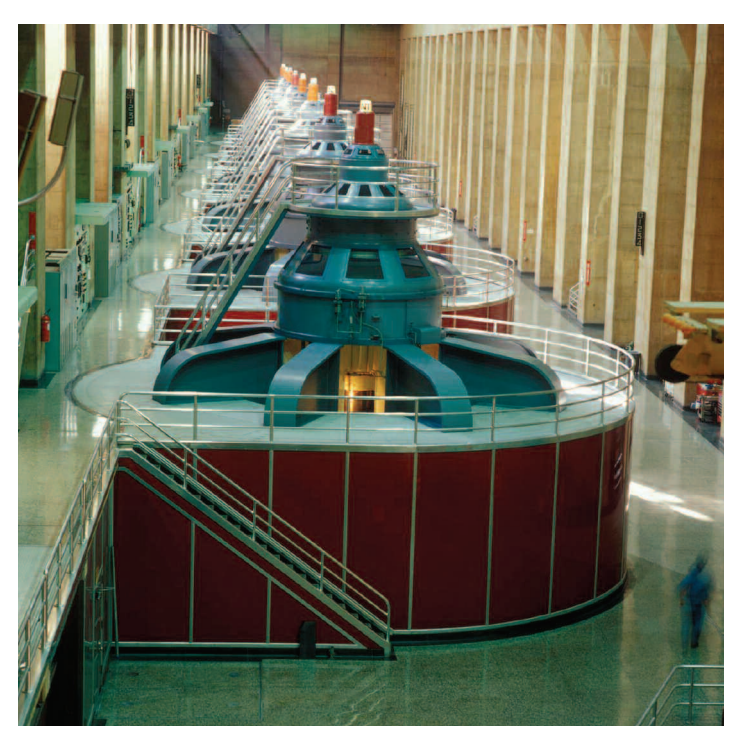
Generators in the Nevada power plant at Hoover Dam. Another similar powerplant is on the Arizona side. Hoover Dam's powerplants generate over 3 billion killowatthours of electricity annually.

We are working to develop specialized, Reclamation-unique training and documentation to ensure that corporate knowledge is not lost through staff retirements. Also, we realize that we have only scratched the surface on applying geographic information system technology to our work, and we are working on several initiatives in that area.