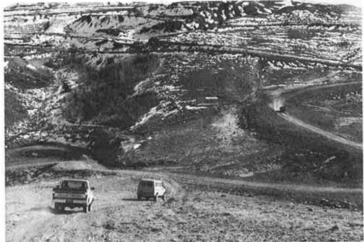
EXPANSE —Wide open spaces and mountains two miles high are covered within minutes with the Inertial Survey technique.

In their final form, the plats presented horizontal and vertical control data consisting of latitude and longitude converted to the appropriate State Plane Coordinate System and elevations on predetermined control monuments and recovered section corners. The proposed center line of the