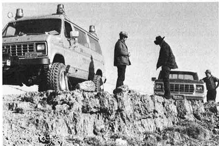
JAGGED ROCK —A rock-topped mountain poses no problem for the Inertial Survey crew.