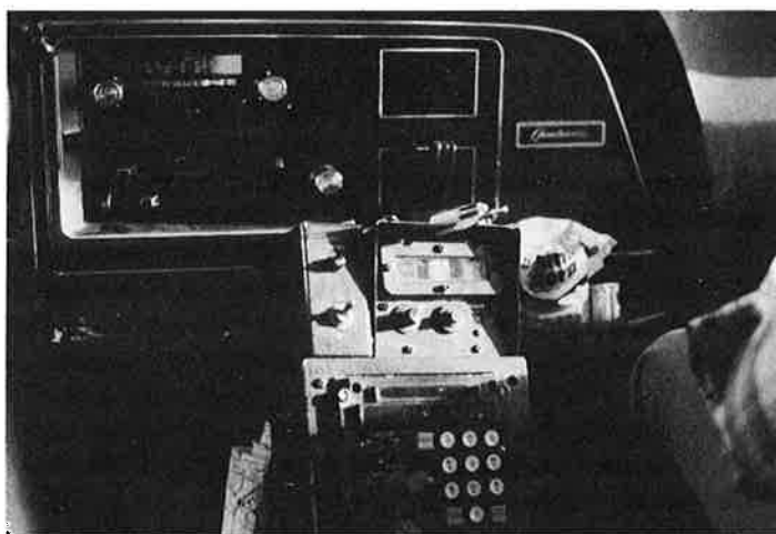
EQUIPMENT —Compact monitors are near the dashboard of the van. Digital readouts indicate any of three coordinates—longitude, latitude and elevation, plus distance traveled—while on-board computers record these values at any chosen time.

In this case, it spelled the difference between cancellation of a major project versus a time-and-money-saving success.