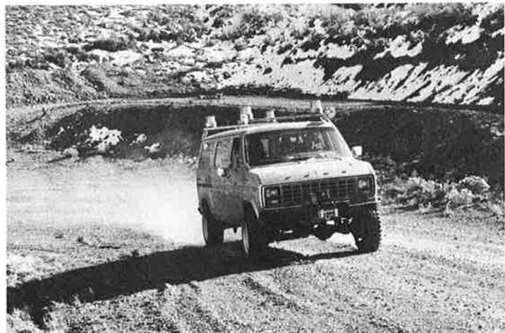
VAN USED —The Inertial Surveying crew uses a four-wheel drive van to scale the rugged terrain.