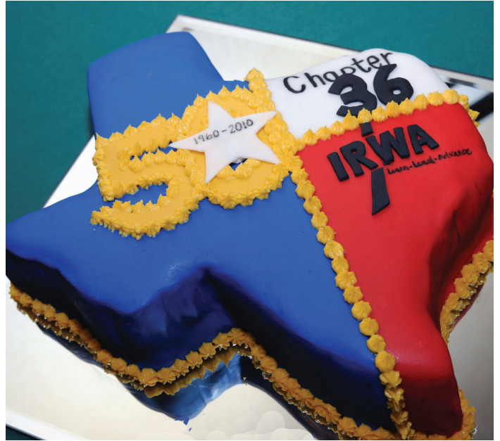
The Chapter’s logo-shaped anniversary cake was an event highlight.

In honor of the milestone, the Chapter transformed their traditional red, white and blue Texas shaped logo into a celebratory version. An anniversary logo-shaped cake was donated and became an event highlight. Thanks to its many longstanding members, chapter memorabilia adorned the banquet room, and photographers were on