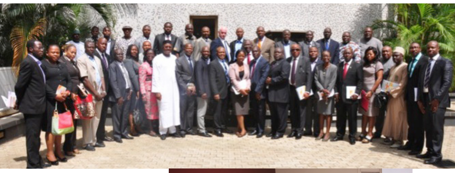
More than 40 professionals attended the chapter meeting and seminar in November. The chapter now boasts over 60 members.