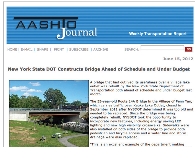
The weekly AASHTO Journal showcases a Project of the Week to highlight excellence in state transportation department projects that are completed on time, under budget and/or using innovative management.