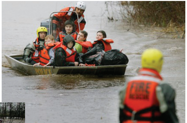
In 2006, when the Puyallup River in Washington State flooded, emergency responders deployed swiftwater rescue teams, boats and even helicopters to rescue people from the rising water.