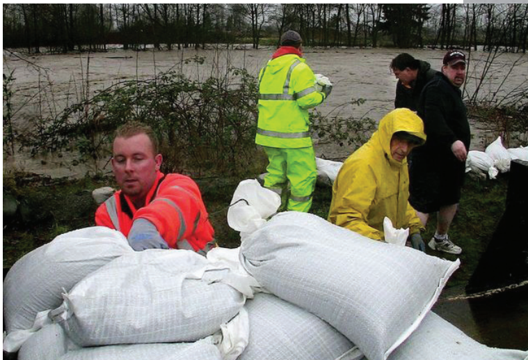
Sand bags were stacked along the Puyallup River when the 2009 flood threatened adjacent mobile home park residents.