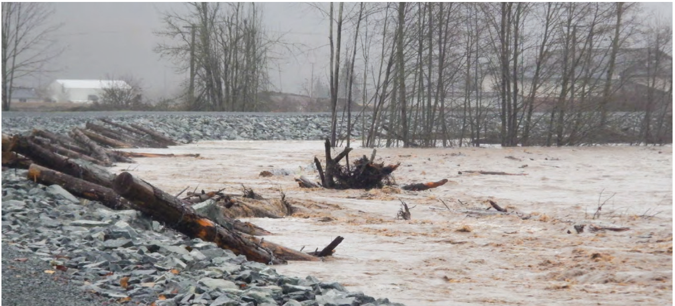
Carefully designed logjams were built to create habitat for chinook salmon, bull trout and steelhead trout. The project is already paying dividends, as the levee has survived several major storms, keeping the city and its residents protected.