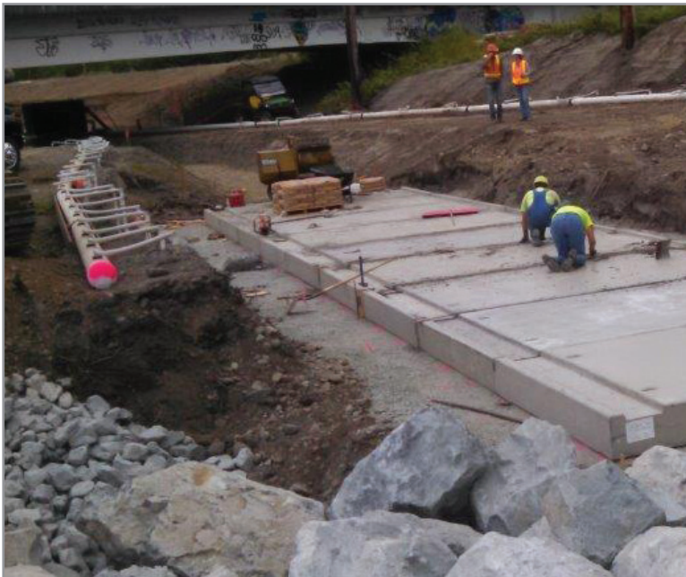
To dewater the site and create a sound structural base for the new levee, over 1,100 interconnected wells were used to continuously pump water out of the ground.

The Washington State Legislature recognized the need to be smart about floodplain restoration and appropriated $50 million for the Coordinated Investment in Puget Sound Floodplains project sponsored by The Nature Conservancy,