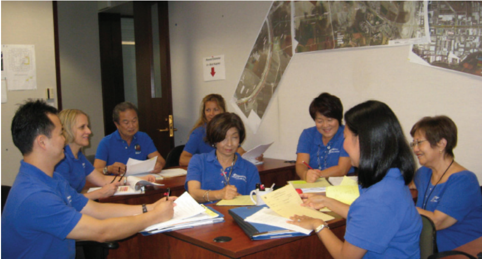
The team conducted weekly staff meetings to discuss the status of acquisition and relocations.