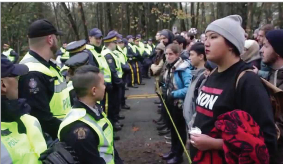
Despite an injunction granted by the B.C. Supreme Court, protesters banded together at Burnaby Mountain in Vancouver for a long drawn out battle.

The point is that society has chosen—through its duly elected representatives—to have decisions about resource development made on its behalf. In making such decisions, is not the overall regulatory process granting social license? As one commentator asked, "Isn't social license something granted by elected officials in a democracy?"