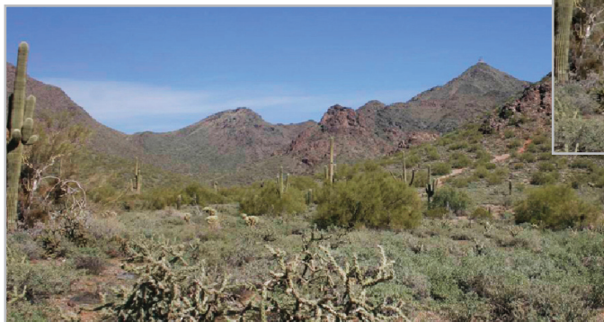
Case #2: By showing the actual site before development (below) in comparison to a 3D model of future development (right), the jury was able to see the true impact on the view corridors.

In many cases, an accurate terrain model alone will often not be enough to educate the jury to the facts of your case. Oftentimes, more visual data is needed, especially if you are trying to explain property lines, easement locations and future development that includes freeways, pipelines, power lines or buildings.