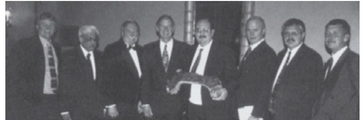
In 1998, IRWA was pleased to welcome the Japan Compensation Consultant Association and the newly created South African Right of Way Association to its International Education Conference.

delegation from South Africa, who came to discuss with the IEC the possibility of affiliating the newly created South African Right of Way Association (SARWA) with IRWA. That was the beginning of a long term relationship, and SARWA representatives have attended every IRWA Annual Conference since.