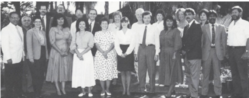
As part of their training program in the '80s, Caltrans enrolled new agents in IRWA Course 101.

This good fortune did not last, although IRWA leadership tried to remain optimistic, continuing to increase educational opportunities and courses. Eventually membership, course attendance, and investment income all dropped. As a result, for a few years in the early '80s, Association expenses were greatly reduced and leadership was forced to pretty much halt the hiring of needed personnel. Fewer funds were available to help finance the committees, regions, chapters and the executive committee. In hopes of rectifying the financial squeeze, a dues increase was put into effect for both regular and junior members.