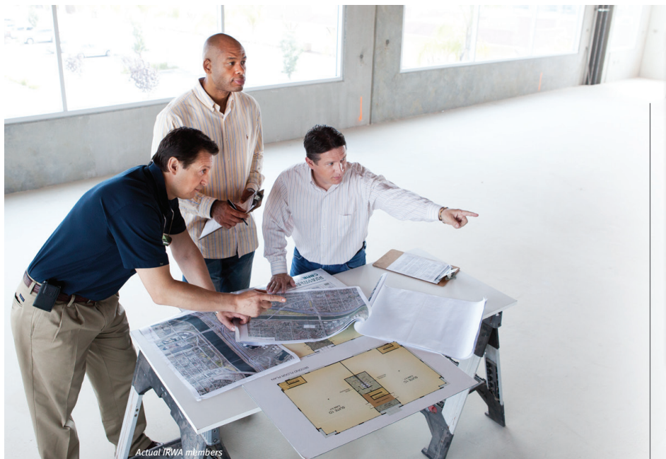
Actual IRWA members