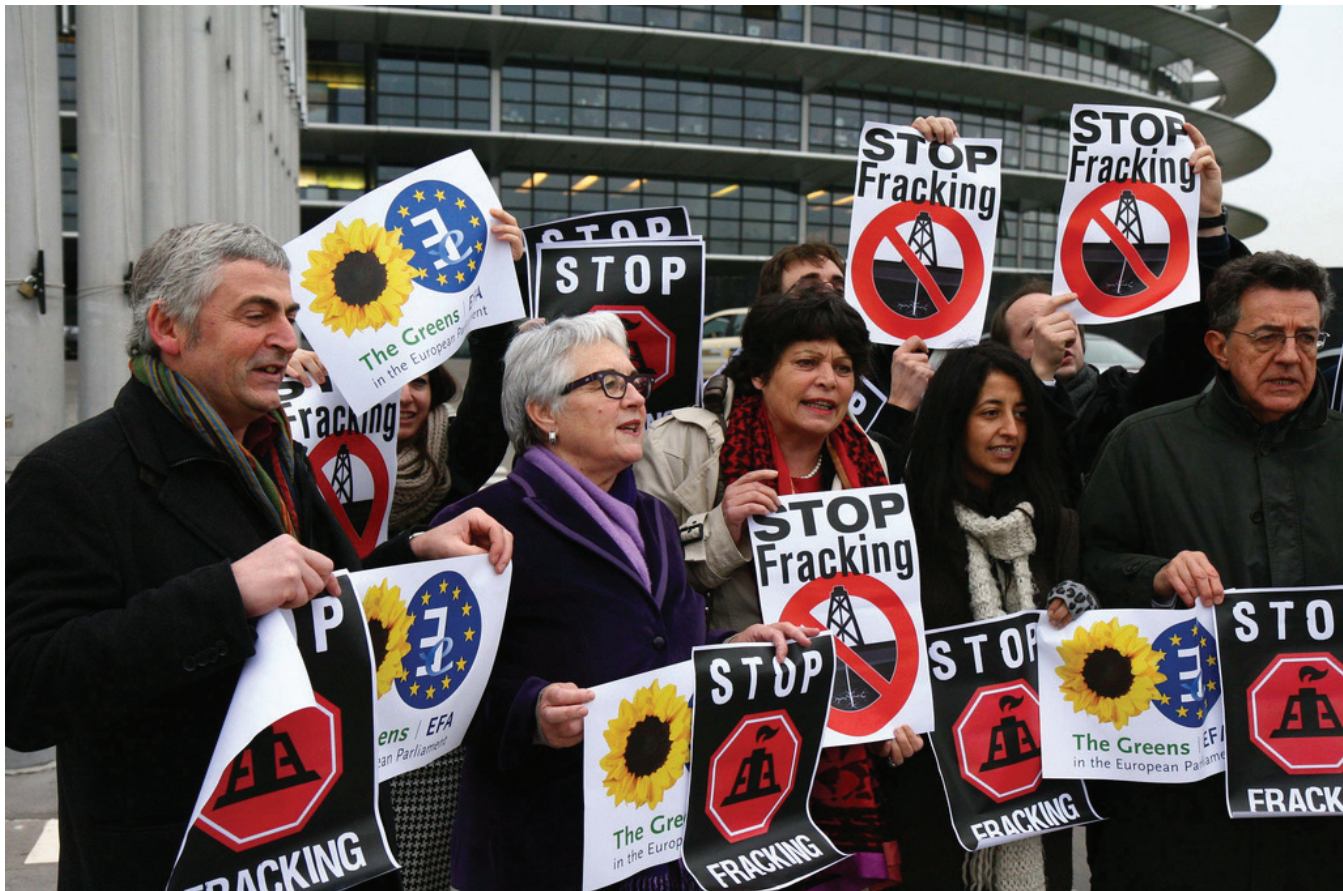
Hydraulic fracturing projects in Poland have generated anger and hostility among those impacted.

Public expectations have shifted and community action has gone from passive to active. This is a dramatic and widespread trend that our company, the JKA Group, has been tracking globally for over 25 years. This shift has become a universal worldwide movement, and traditional communication techniques are no longer useful or tolerated in the international communities.