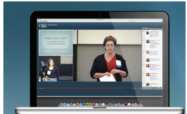
This summer, a selected third-party partner will help IRWA facilitate onsite and multi-site classroom education from any location.

We are also developing our intermediate and classroom-only advanced education programming, based on the specialty certification survey that is currently underway. Look for more apps, too, starting with our Principles of Right of Way Textbook desk reference, available for your iPhone, iPad and Kindle.