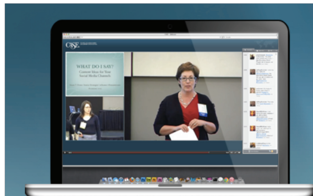
This summer, a selected third-party partner will help IRWA facilitate onsite and multi-site classroom education from any location.

We are also developing our intermediate and classroom-only advanced education programming, based on the specialty certification survey that is currently underway. Look for more apps, too, starting with our Principles of Right of Way Textbook desk reference, available for your iPhone, iPad and Kindle.