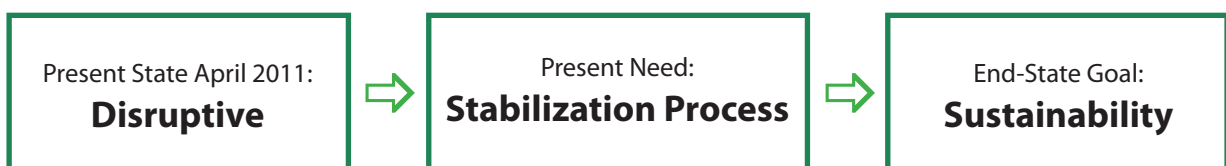
Figure 1: The Path to Sustainability

To the extent that Guam's informal cultural systems and formal institutions can be mobilized to absorb and benefit from the change that the Marine Corps will be creating, that is the degree to which the Marines will experience unparalleled success in their future relations with the people of Guam.