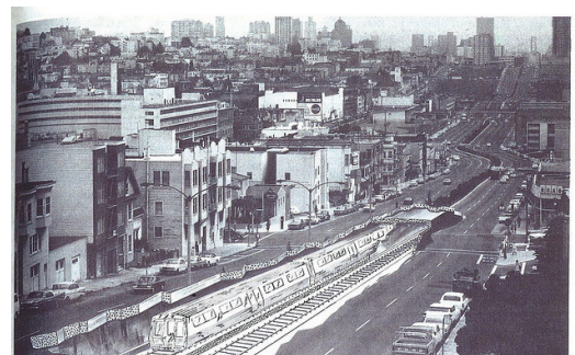
Proposed Bay Area Rapid Transit (BART) system circa 1966