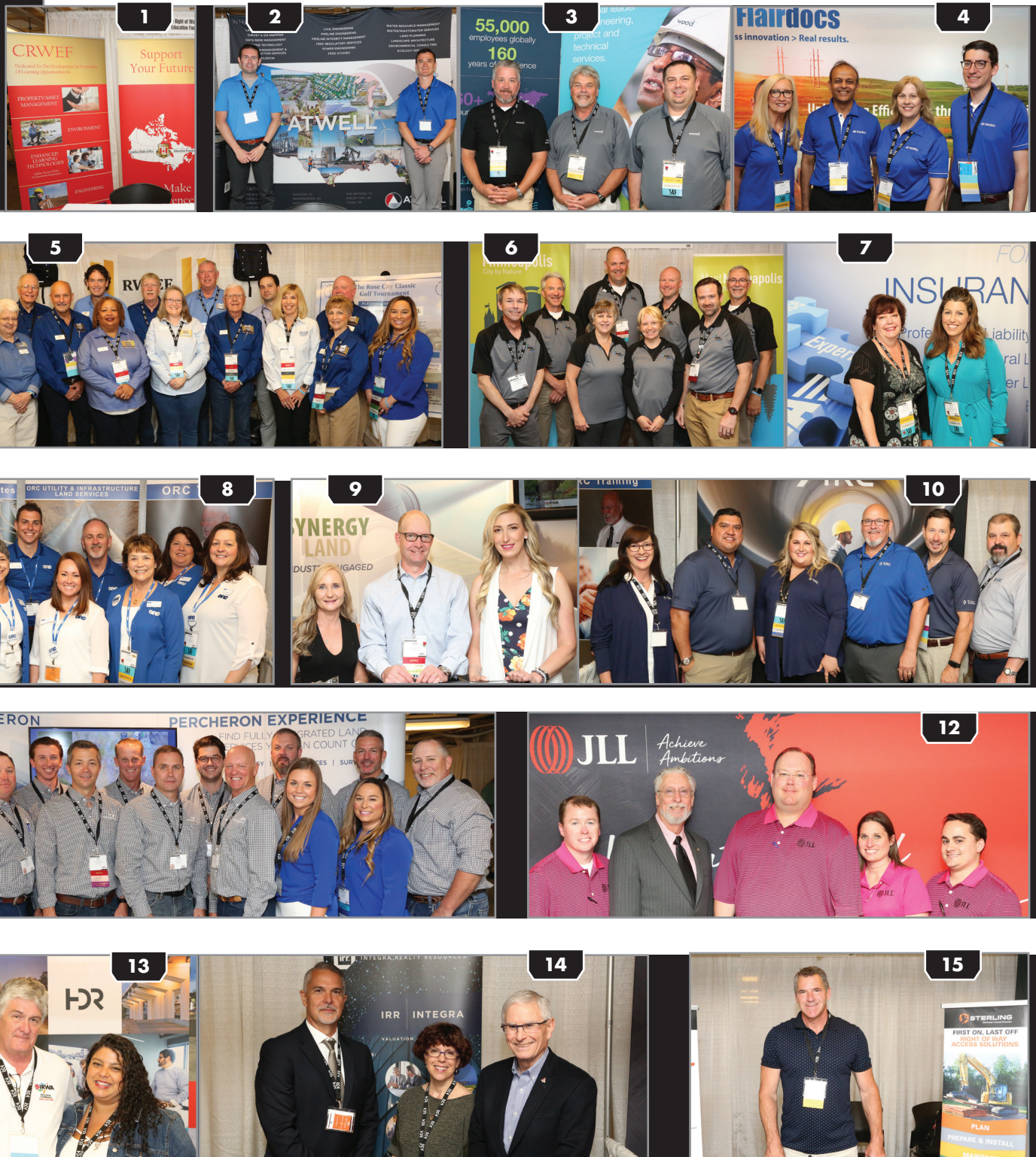
1. Canadian Right of Way International Education Foundation 2. Atwell, LLC 3. Wood 4. Flairdocs 5. Right of Way International Education Foundation 6. 2020 Conference Host – Minneapolis, MN 7. LIA Administrators & Insurance Services 8. OR Colan 9. Synergy Land Services 10. TRC 11. Percheron 12. JLL Valuation & Advisory Services, LLC 13. HDR 14. Integra Realty Resources 15. Sterling