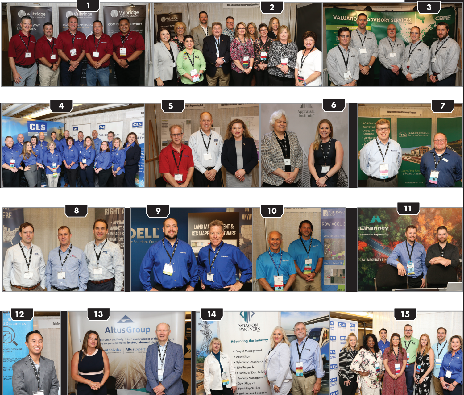
1. Valbridge Property Advisors 2. IRTA International Transportation Committee 3. CBRE, Inc. 4. Contract Land Staff 5. IRTA International Electric & Utilities Committee and IRTA International Surveying & Engineering CoP 6. Appraisal Institute 7. ROWE Professional Services Company 8. Allen, Williford & Seale, Inc. 9. Pandell 10. Farnsworth Group, Inc. 11. McElhanney Ltd. 12. DataTree by First American 13. Altus Group Ltd. 14. Paragon Partners Ltd. 15. IRTA Young Professionals

With hundreds of conference attendees, the Exhibit Hall served as an ideal venue for exhibitors to showcase their products and services to the dedicated right of way professionals in attendance. For a chance to win an iPad, each conference attendee received an Exhibit Hall Passport, which encourages participants to visit each booth to obtain a signature. This created a highly interactive environment among the participants and was a great success in generating traffic.