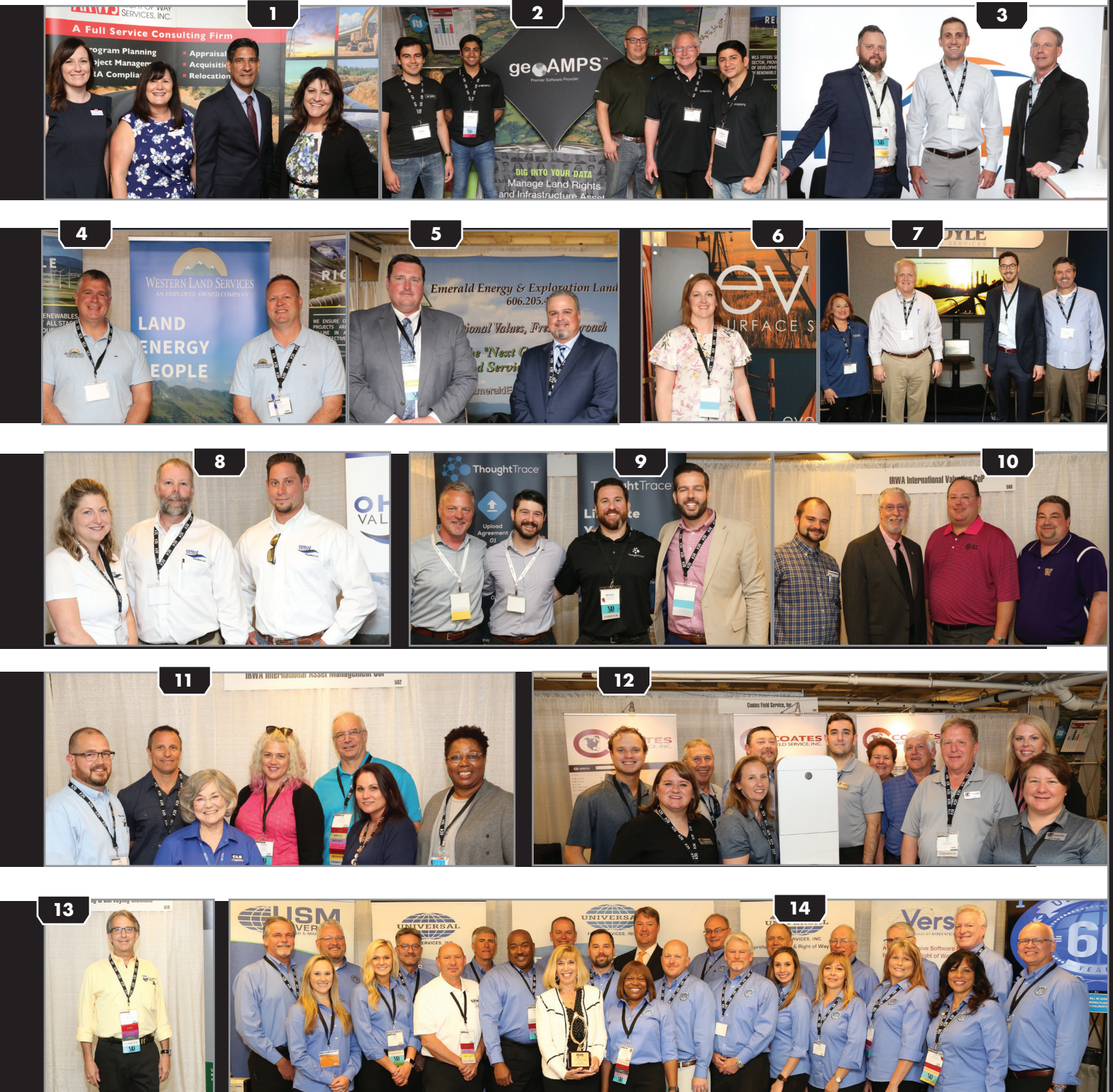
1. Associated Right of Way Services, Inc. 2. geoAMPS 3. Holland Right of Way 4. Western Land Services, Inc. 5. Emerald Energy & Exploration Land Company 6. Evolve Surface Strategies, Inc. 7. Doyle Land Services, Inc. 8. Ohio Valley Acquisition LLC 9. ThoughtTrace, Inc. 10. IRWA International Valuation CoP 11. IRWA International Asset Management CoP 12. Coates Field Service, Inc. 13. Utility Engineering & Surveying Institute 14. Universal Field Services, Inc.