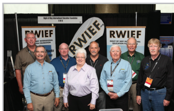
Right of Way International Education Foundation