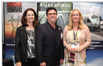
Overland, Pacific & Cutler, Inc.