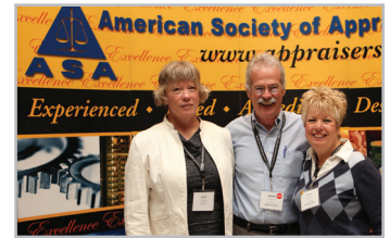
American Society of Appraisers