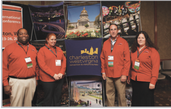
IRWA 2013 Conference Host-Charleston, WV