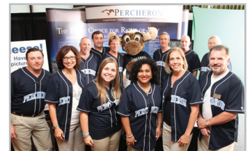
Percheron Acquisitions, LLC