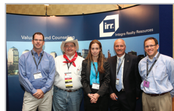
Integra Realty Resources, Inc.