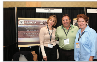
Coates Field Service, Inc.