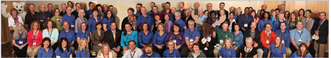
Alaska, Idaho, Montana, Oregon, Washington