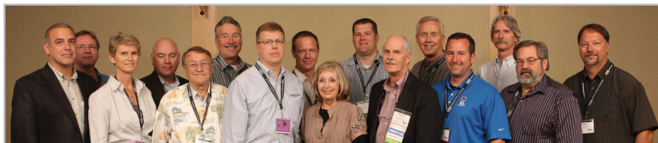
Surveying and Engineering