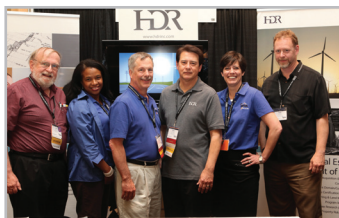
HDR Engineering, Inc.