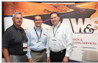
Allen, Williford & Seale, Inc.