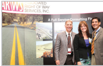
Associated Right of Way Services, Inc.