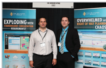
The Silvacom Group