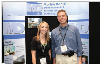
Martyn Daniel, LLC