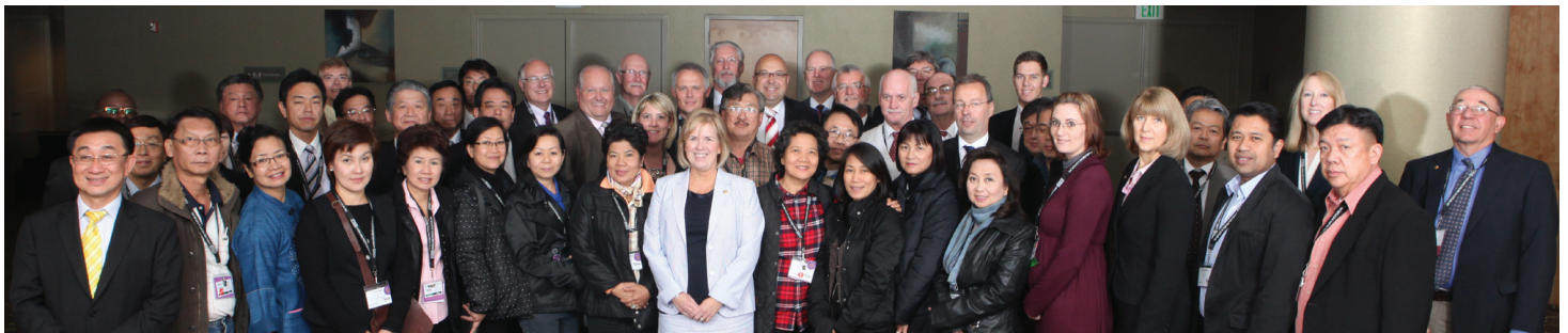
IRWA hosted the annual International Affiliates Luncheon with delegates from all over the globe.