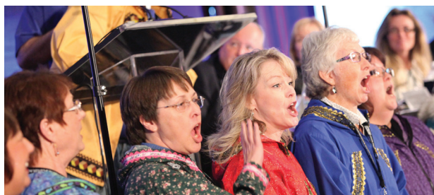
Following a vote among Directors, Anchorage, Alaska was selected as host city for the 2017 conference.

We are pleased to give special recognition and thanks to the sponsors of IRWA's 58 th Annual International Education Conference. Please join us as we extend our sincere appreciation for their gracious and generous contributions.