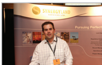
Synergy Land Services Ltd.