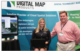
Digital Map Products