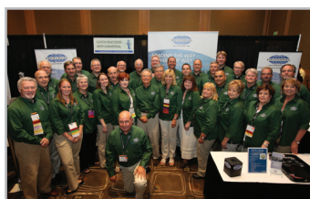
Universal Field Services, Inc.