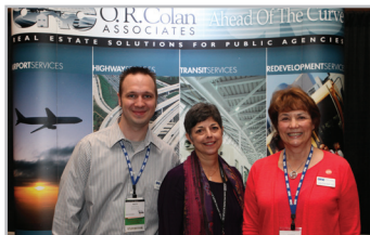
O.R. Colan Associates