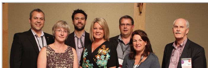
Canadian Right of Way Education Foundation