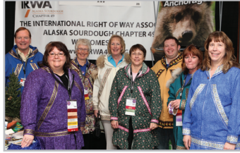
IRWA 2017 Conference Bidder- Anchorage, AK