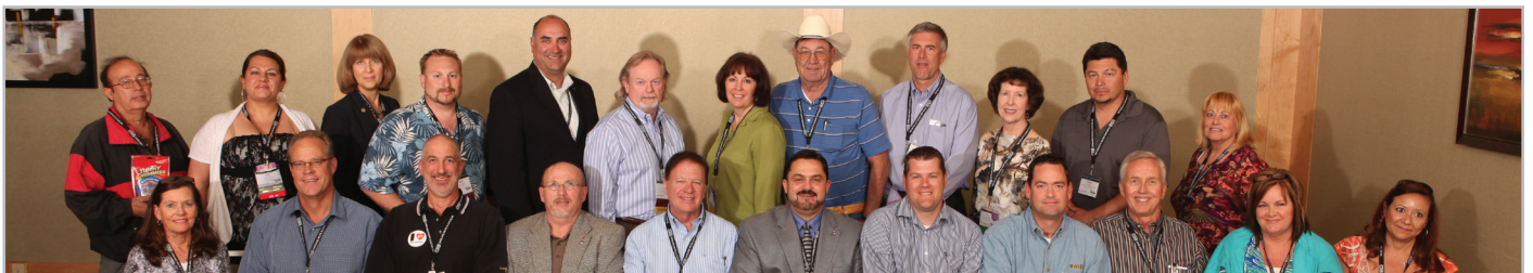
Colorado, New Mexico, Utah, Wyoming