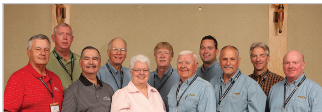
Right of Way International Education Foundation