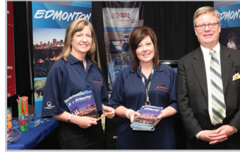
IRWA 2017 Conference Bidder-Edmonton, AB