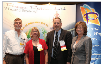
Paragon Partners Ltd.