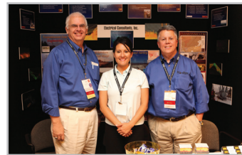
Electrical Consultants, Inc.