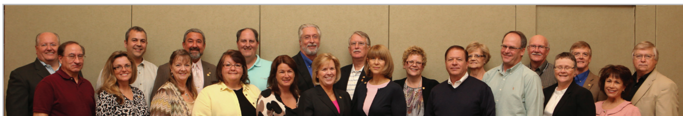
International Governing Council