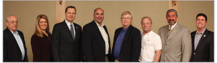
Communications and Marketing