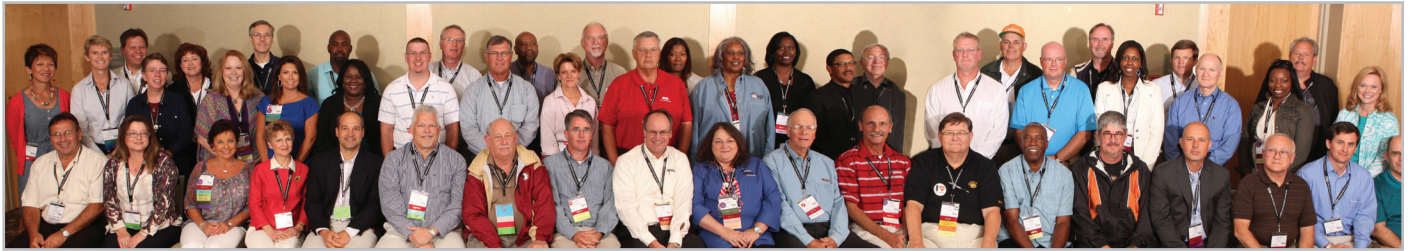
Alabama, Florida, Georgia, Mississippi, North Carolina, South Carolina, Tennessee