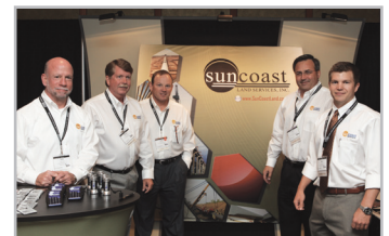
SunCoast Land Services, Inc.