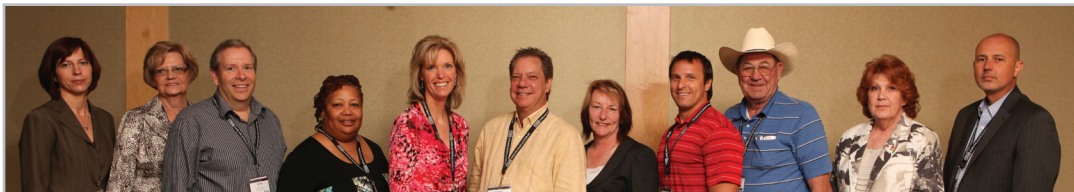
Nominations and Elections