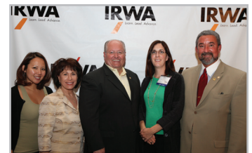
International Right of Way Association