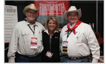
IRWA 2017 Conference Bidder-Fort Worth, TX