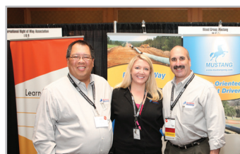
Wood Group Mustang