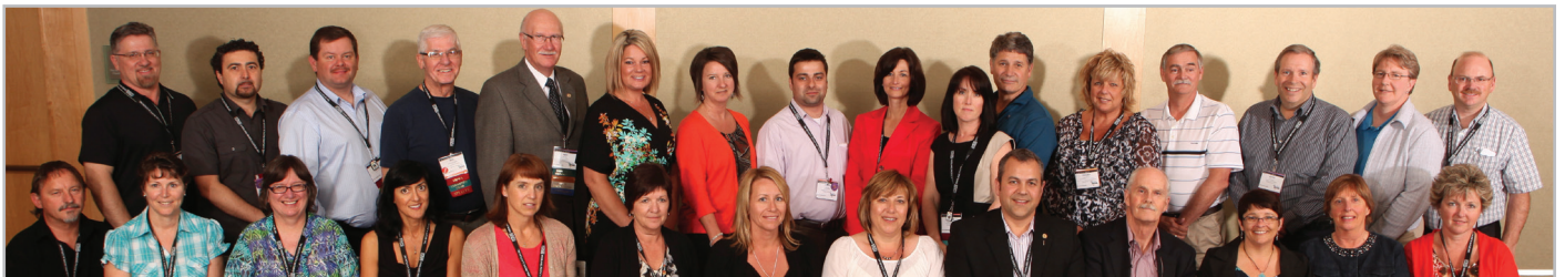
Ontario, New Brunswick, Newfoundland, Nova Scotia, Quebec, Prince Edward Island