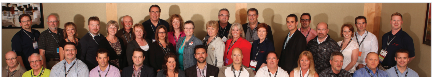
Alberta, British Columbia, Manitoba, Northwest Territories, Nunavut, Saskatchewan