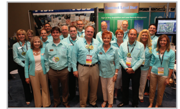
Contract Land Staff, Inc.