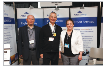
Altus Group Limited