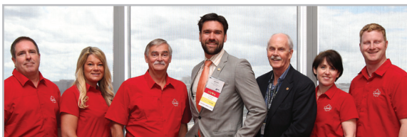
CANADIAN RIGHT OF WAY EDUCATION FOUNDATION