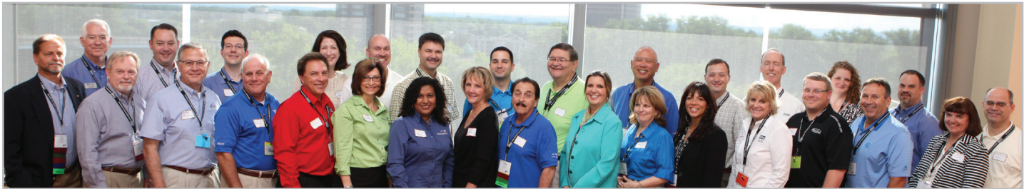
ELECTRIC & UTILITIES