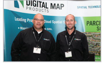
DIGITAL MAP PRODUCTS