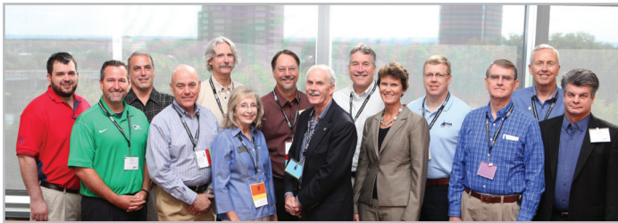
SURVEYING & ENGINEERING