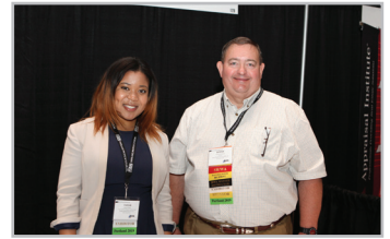
INTEGRA REALTY RESOURCES, INC.