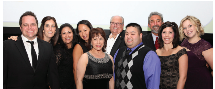
IRWA Headquarters staff celebrate the completion of another successful conference.