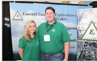
EMERALD ENERGY & EXPLORATION LAND CO.