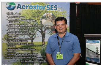
AEROSTAR SES, LLC