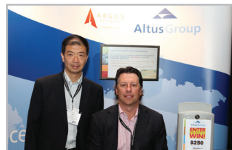
ALTUS GROUP LIMITED