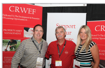
CANADIAN RIGHT OF WAY EDUCATION FOUNDATION