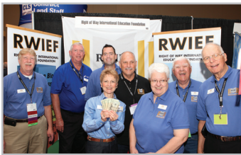
RIGHT OF WAY INTERNATIONAL EDUCATION FOUNDATION