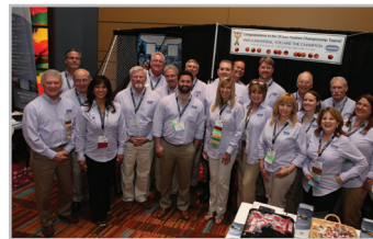
UNIVERSAL FIELD SERVICES, INC.