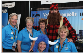
IRWA 2019 CONFERENCE BIDDER - MINNEAPOLIS