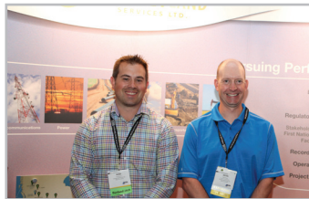
SYNERGY LAND SERVICES LTD.