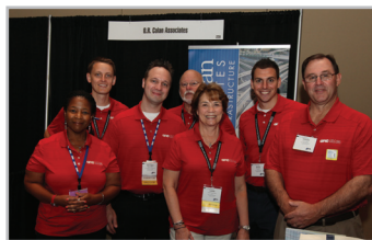
O.R. COLAN ASSOCIATES