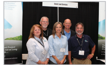
STEELE LAND SERVICES