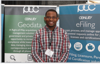
PCC TECHNOLOGY GROUP