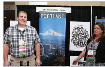
IRWA 2019 CONFERENCE BIDDER - PORTLAND