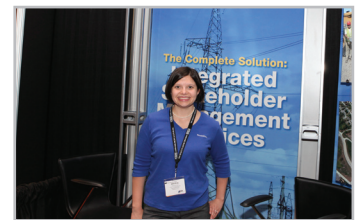
BURNS & MCDONNELL