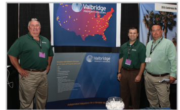
VALBRIDGE PROPERTY ADVISORS