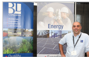
BL COMPANIES, INC.