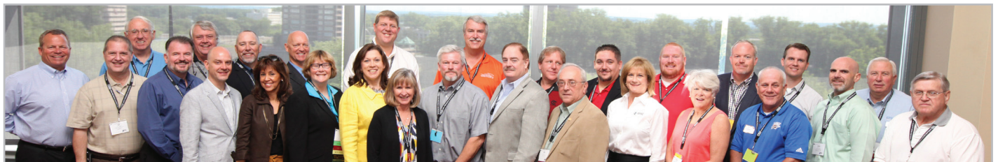
OIL & GAS PIPELINE