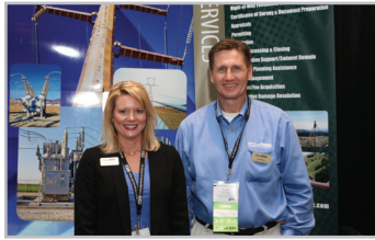
ELECTRICAL CONSULTANTS, INC.