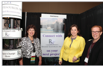
ROLAND RESOURCES, INC.