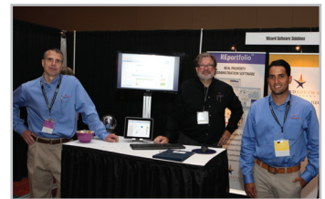
WIZARD SOFTWARE SOLUTIONS