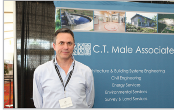
CT MALE ASSOCIATES