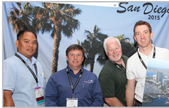
IRWA 2015 CONFERENCE HOST - SAN DIEGO