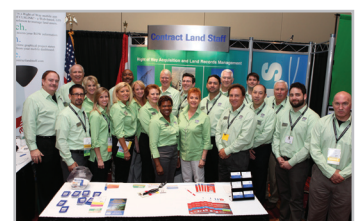
CONTRACT LAND STAFF