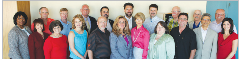
INTERNATIONAL GOVERNING COUNCIL