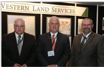
WESTERN LAND SERVICES, INC.