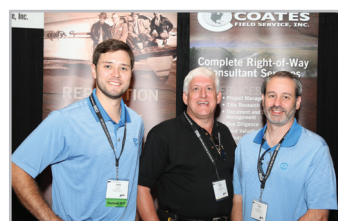
COATES FIELD SERVICE, INC.