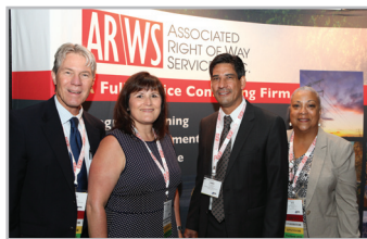
ASSOCIATED RIGHT OF WAY SERVICES, INC.