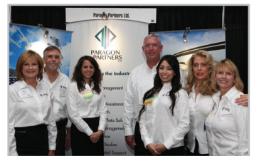
PARAGON PARTNERS LTD.