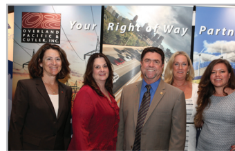
OVERLAND, PACIFIC & CUTLER, INC.