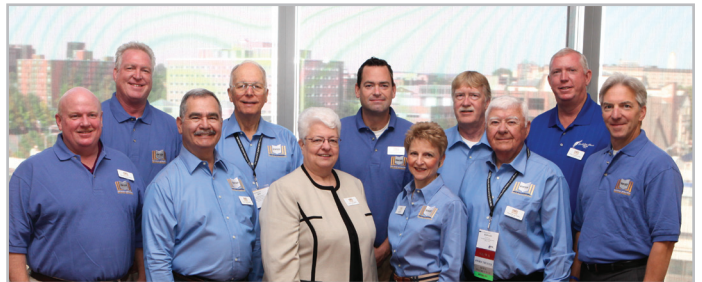
RIGHT OF WAY INTERNATIONAL EDUCATION FOUNDATION