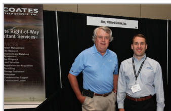
ALLEN, WILLIFORD & SEALE, INC.