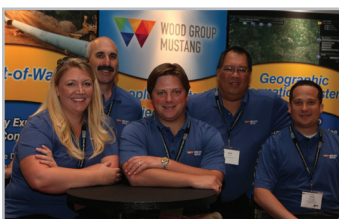
WOOD GROUP MUSTANG