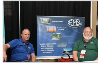
ENERGY MANAGEMENT & SERVICES CO.