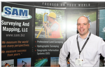
SURVEYING AND MAPPING, LLC