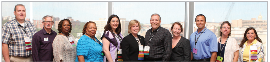
NOMINATIONS AND ELECTIONS